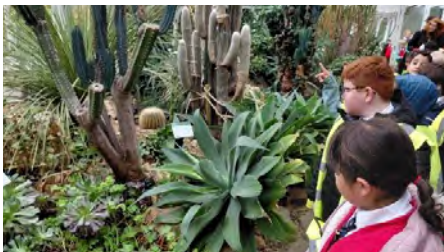
Success through Endeavour

All children have shown great curiosity and enthusiasm throughout, and we are very proud of how they represented Kineton Green Primary School.