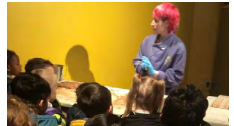
Strength through Diversity