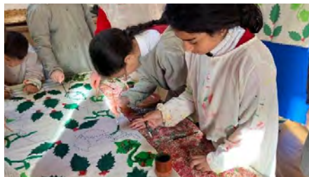
Ambition through Challenge